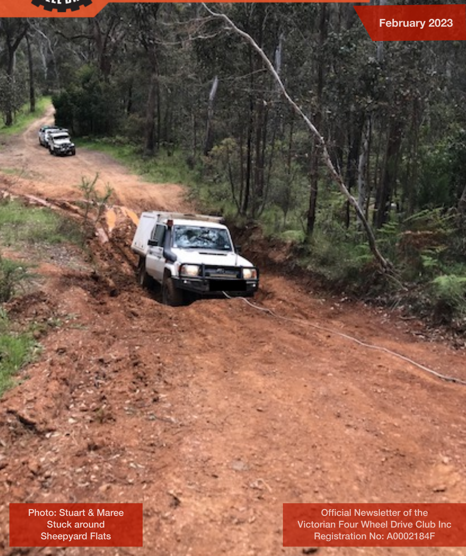
Stuck around Sheepyard Flats

Official Newsletter of the Victorian Four Wheel Drive Club Inc Registration No: A0002184F