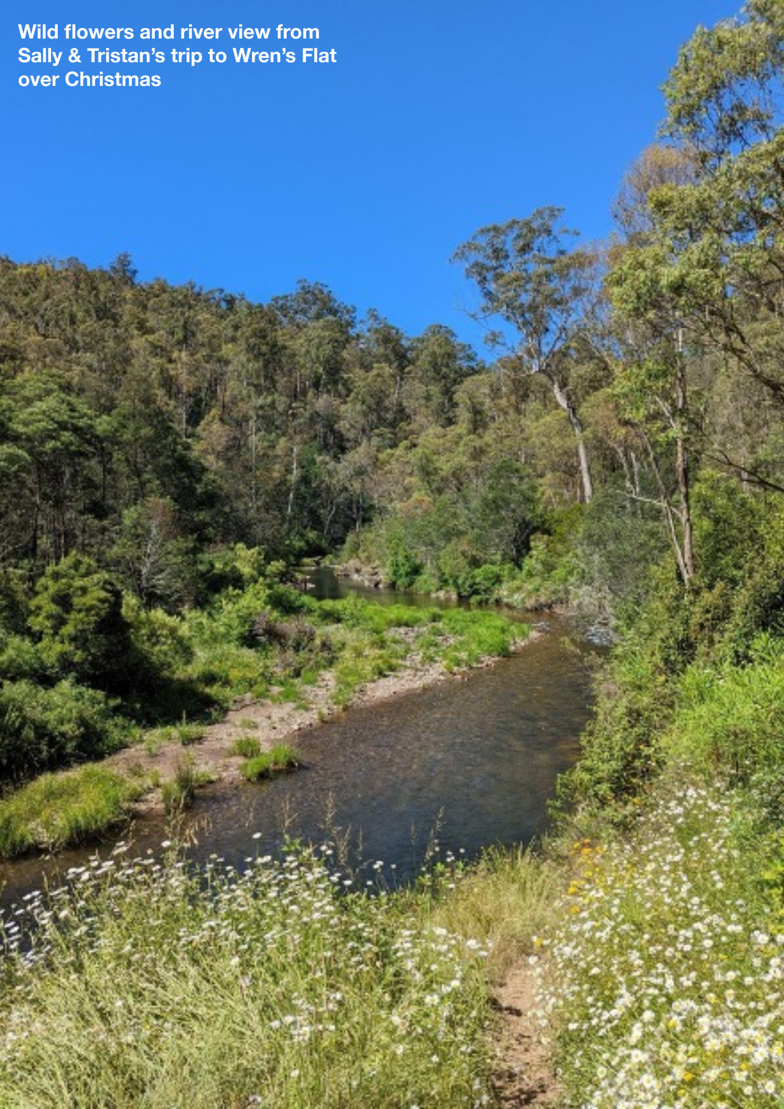
Wild flowers and river view from Sally & Tristan's trip to Wren's Flat over Christmas