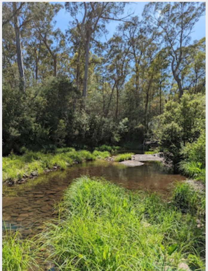
The view of the nearby river