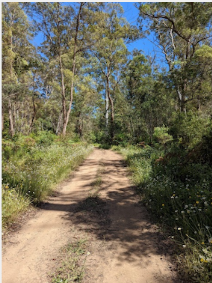
Entry track down Silvermine Road.