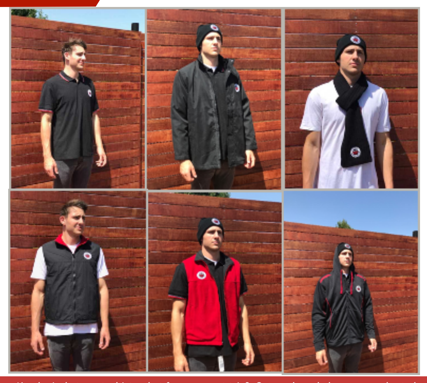
Need a jacket, vest, shirt or hat for your next trip? Get ready and place your order today.