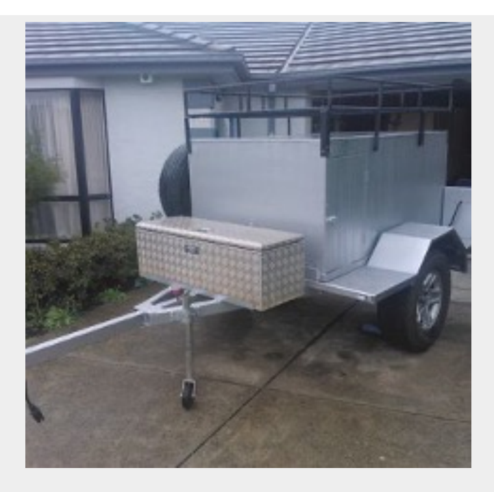
As time went on, the trailer go some add-ons, like a height adjustable awning: