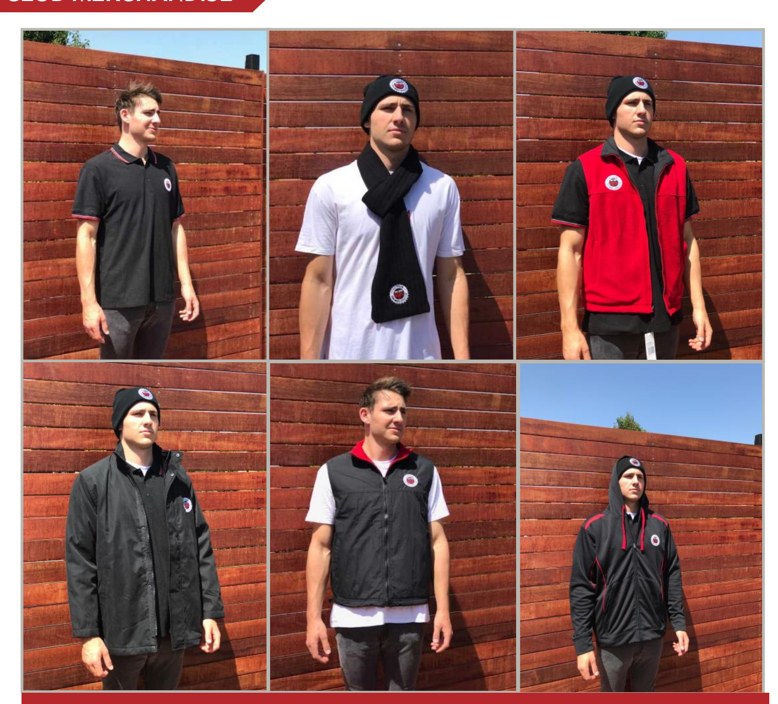
Need a jacket vest, shirt or hat and scarf or your next trip? Get ready and place your today.