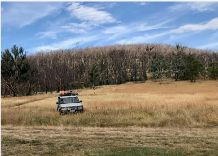
A disco on the discovery trail.

The fires have destroyed much of the undergrowth, but the trees are showing signs of regeneration. It's hard to image how hot it must have been as the charred remains of the forest shows trees over 20m high fully burnt. Finally camping at the foot of Mt Stewart