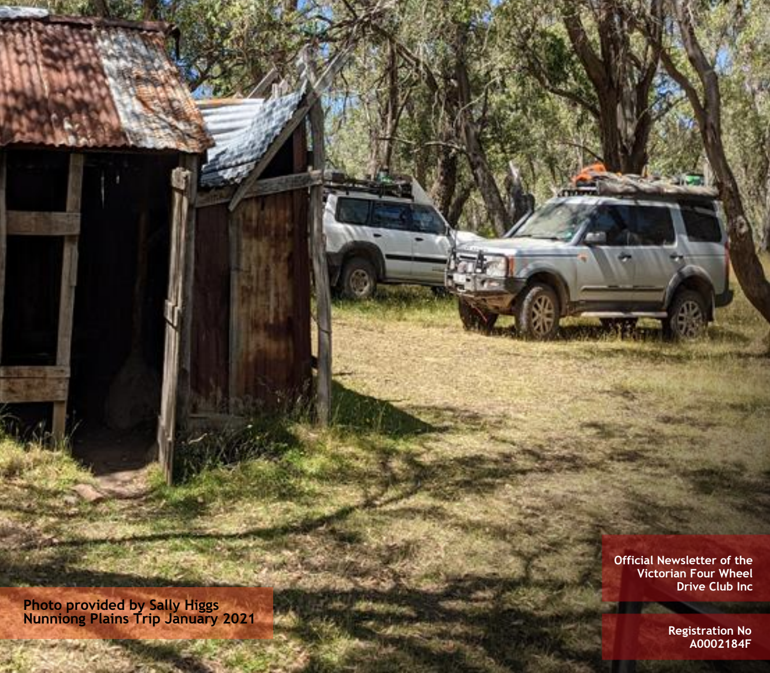
Nunniong Plains Trip January 2021

Official Newsletter of the Victorian Four Wheel Drive Club Inc