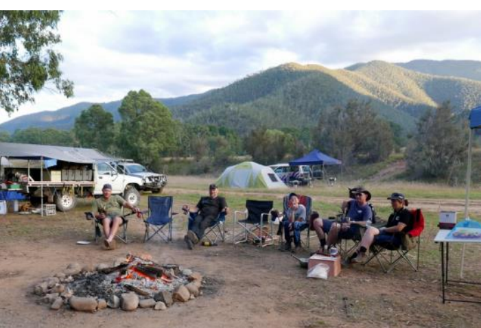
Day 4 - Easter Monday

The birds woke us early at 6:30 telling us it was time to get up and get packed. With cold breakys done the usual organised chaos of packing everything away ensured. The planned leaving time was set for 9am - thankfully we were ready all on time for a casual departure; we "swung" past the swing bridge that Owen, Wendy, Marcus and Helen had visited the previous day to 'check it out'. A nice little spot. Continued on our way up through Zeka Spur track, lots of traffic