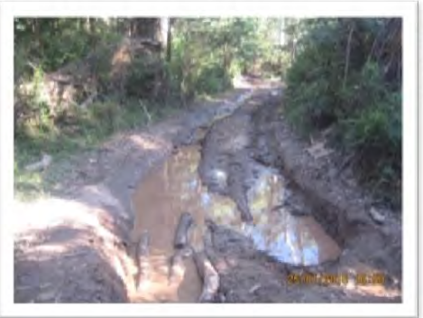
Mud to tackle. This went on for 2 hours.