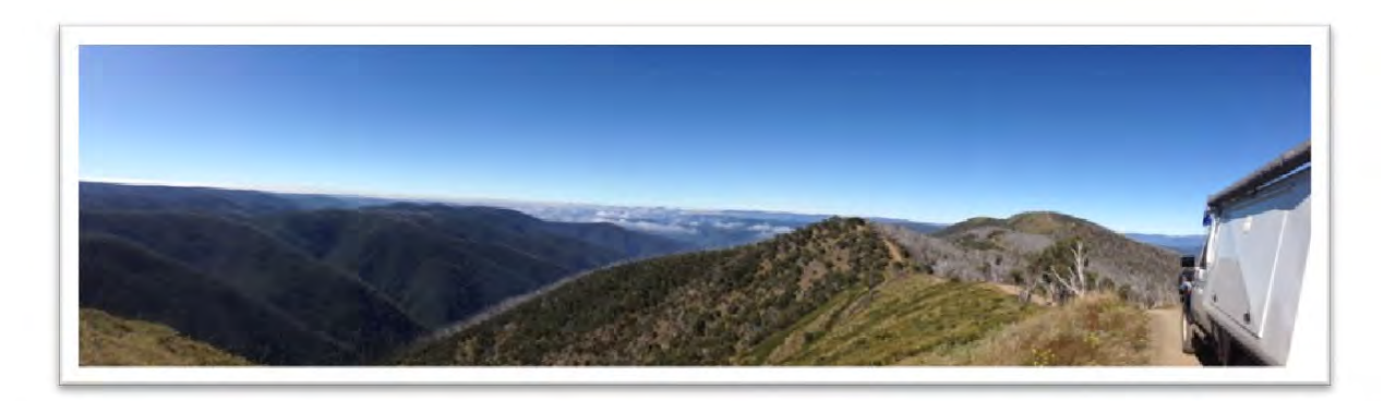
Blue rag track, Success for everyone,