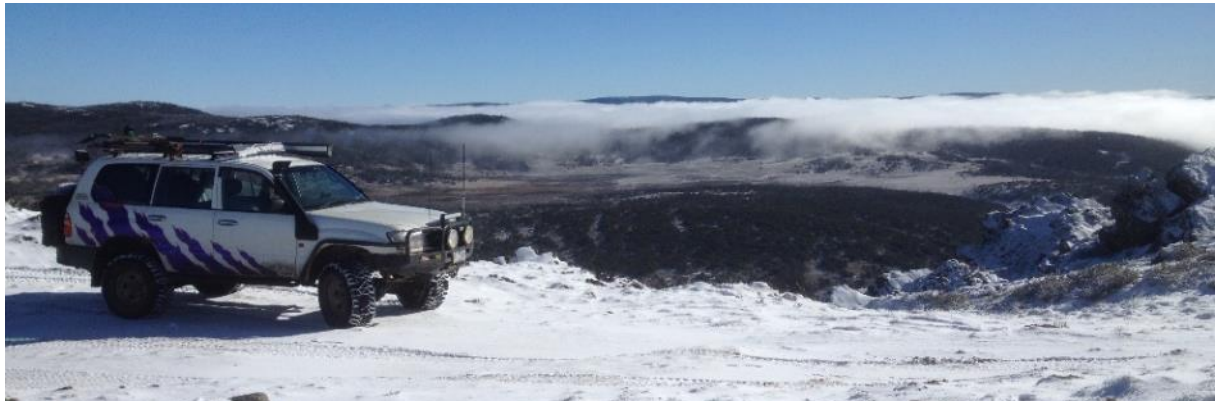
Official Newsletter of the Victorian Four Wheel Drive Club Inc

We stopped in at Horseyard Hut / Flat just in time for lunch and then we made our