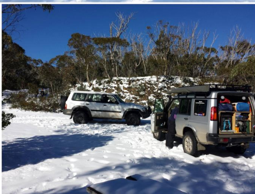
Official Newsletter of the Victorian Four Wheel Drive Club Inc