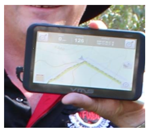
Registration No A0002184F

Official Newsletter of the Victorian Four Wheel Drive Club Inc