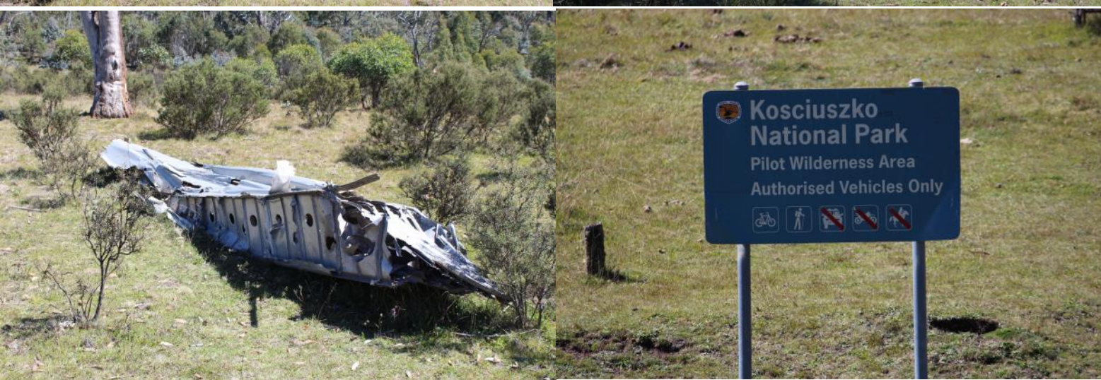
for the source of the Murray.

Well we found it and here's a snap shot of the GPS