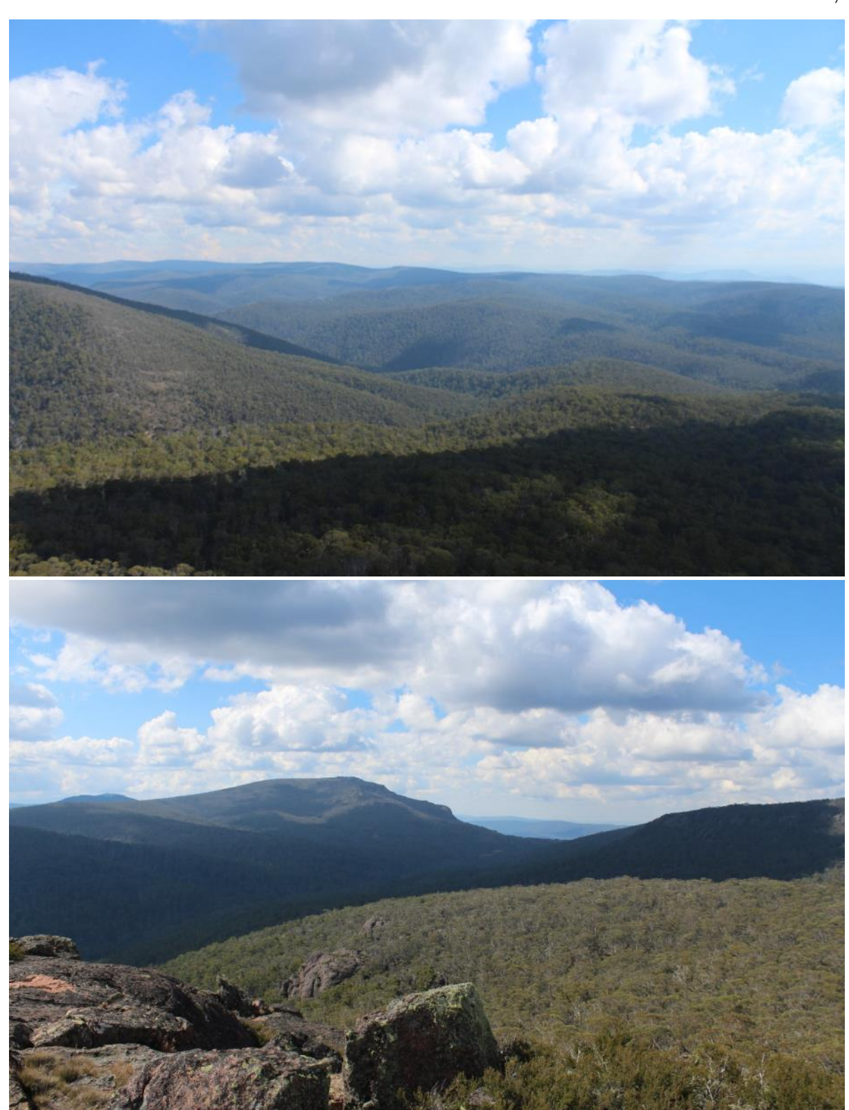
On some paper maps and GPS units they have the Rams Horn track as a through track to the Cobberas, but they aren't. It is clearly signed at Limestone Road that it is a 'No thru Road'.

After lunch, back onto Limestone and then right onto Cobberas track, near Native Dog Dog Flat Camping Ground. Plenty of other groups based there for the weekend.