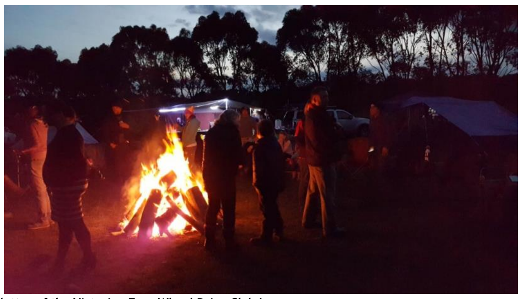
Official Newsletter of the Victorian Four Wheel Drive Club Inc

Thanks to everyone how made the effort to come and join us. Until next year!