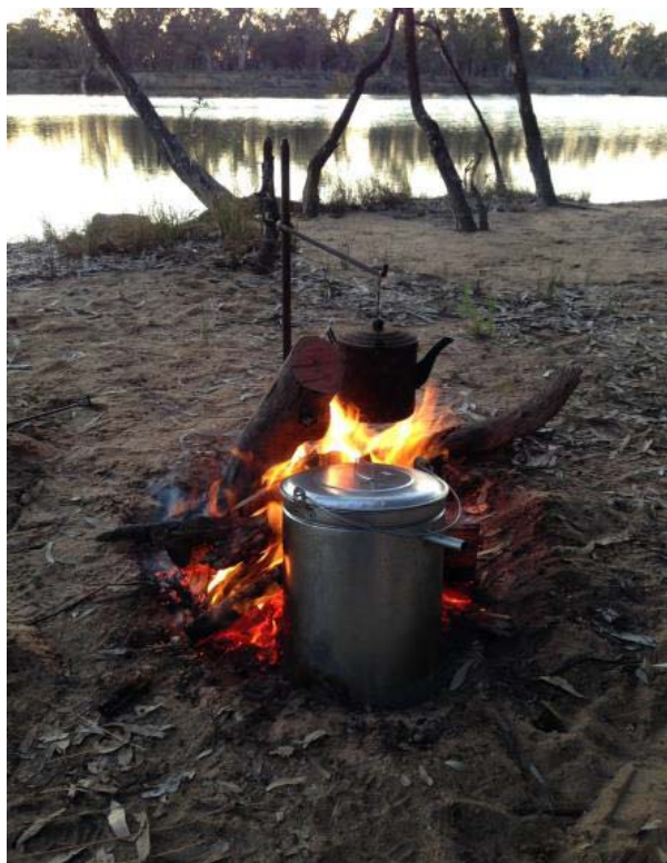
Camp fire at Ned's Corner

Once they got back to camp they then discovered that Stu's chair was still usable and it was only burnt in the top right corner of the chair but Stu still got his new one out to try it and discovered that it was faulty. The wind was still howling and everyone had dinner and went to bed reasonably early that night.