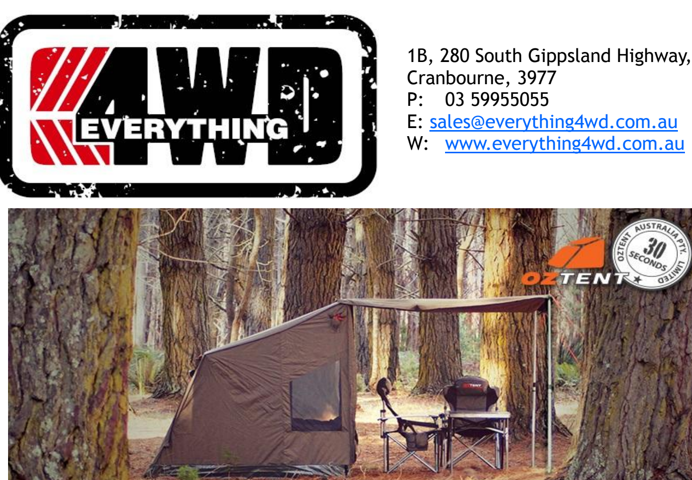
We are now distributors of the great OZTENT range of products with great club pricing