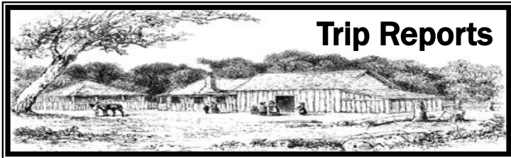
The Annual Pub to Pub to Pub 4WD Weekend 9 – 11 November 2012