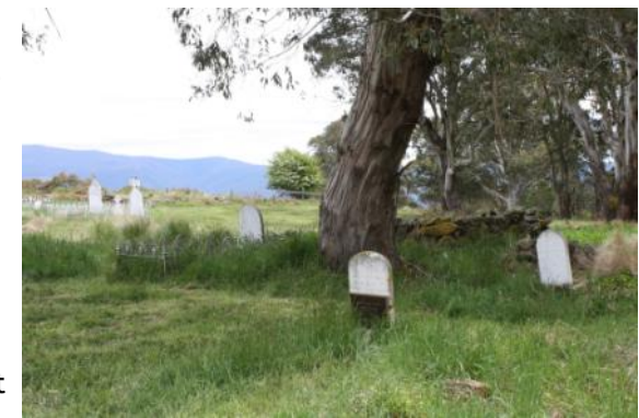
Registration No A0002184F

A few uturns were done and then we decided to tackle one last track, down into Walhalla. This track started out