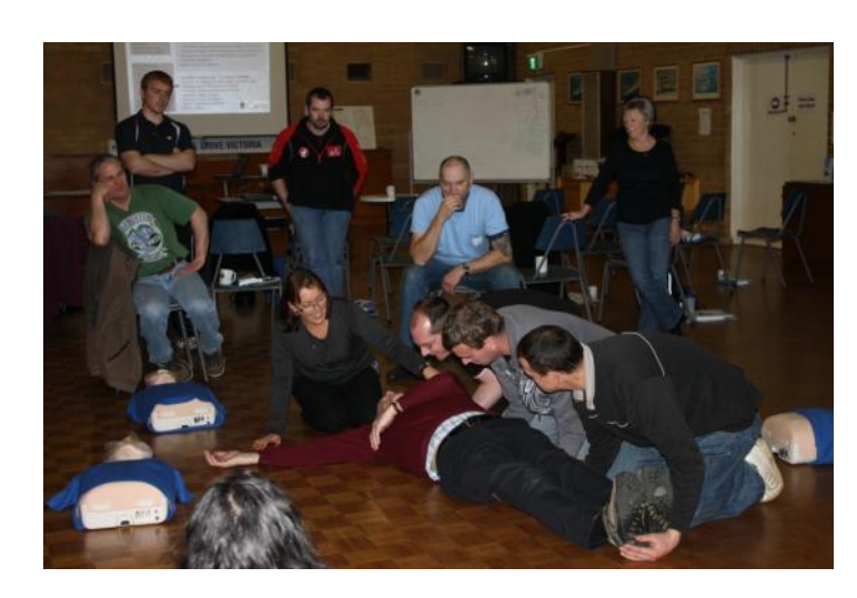
First Aid Level Two Training

Saturday 20th & Saturday 27th of August 2011