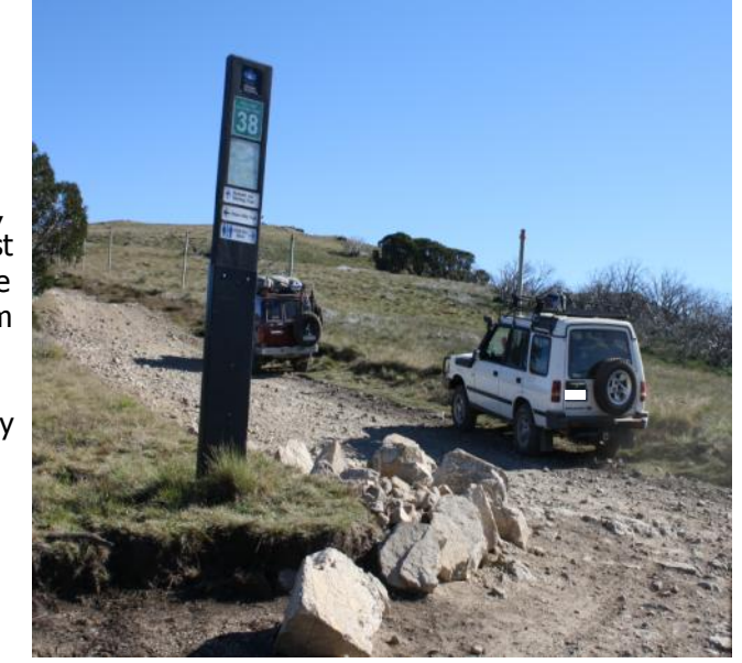
Official Newsletter of the Victorian Four Wheel Drive Club Inc

We reached Craig's Hut with a few other people there, it was very windy, but still a perfect day to take some photos. Then we got talking to some other people there and found out, they had ignored the road closures signs driven around them and straight on through to Craig's Hut. This was now making a lot of sense with the other car that we had also sighted, back down at Bindaree Falls.