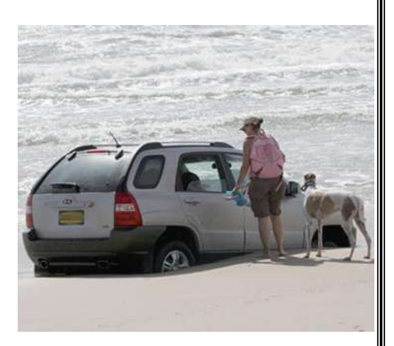
What Happens if you take a Kia to the Beach?