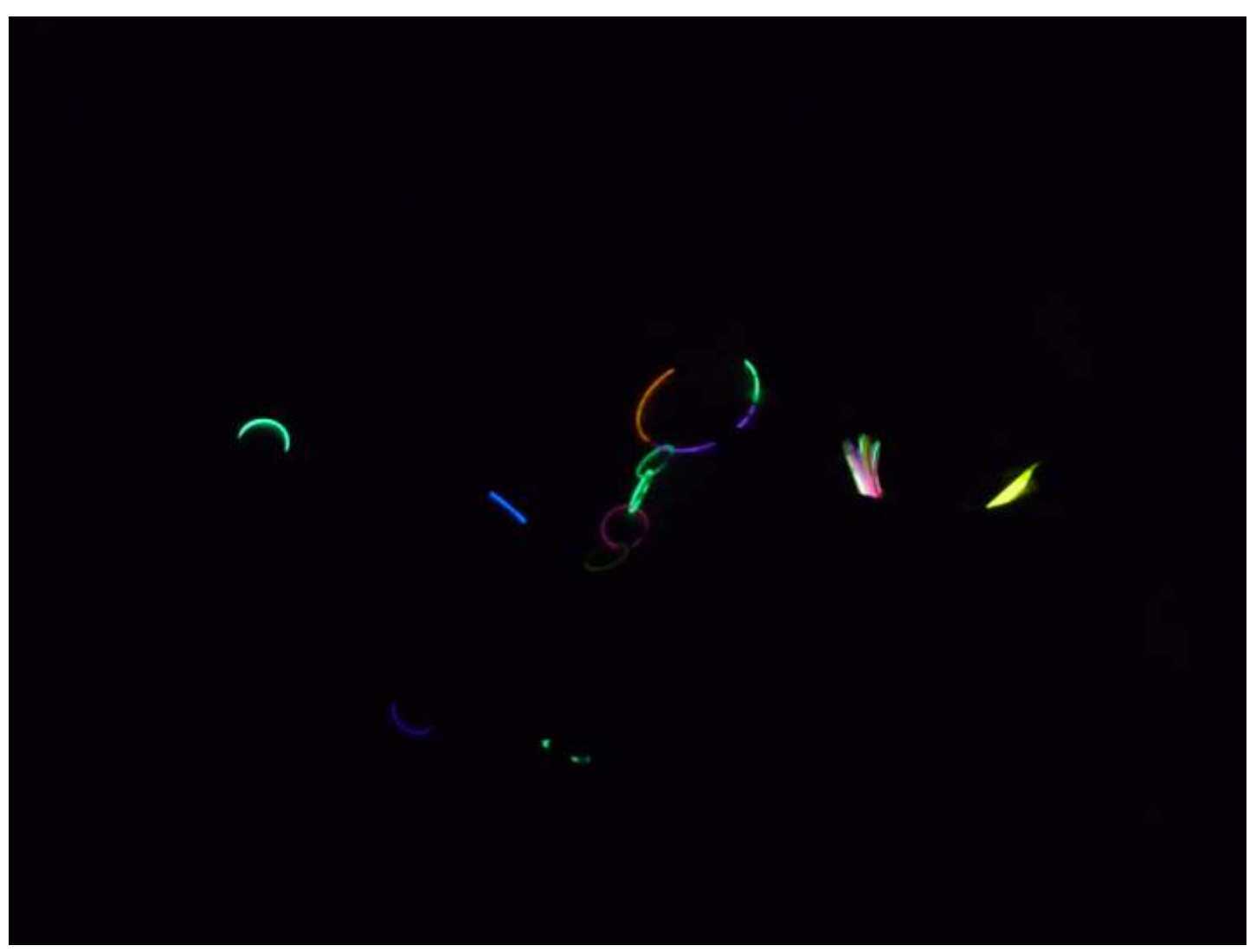
Official Newsletter of the Victorian Four Wheel Drive Club Inc

The rain started two hours later and there were a few lights around the camp ground as people made sure they were watertight. Then it was off to sleep again, listening to the sounds of the rain and the thunder rumbling around the hills.