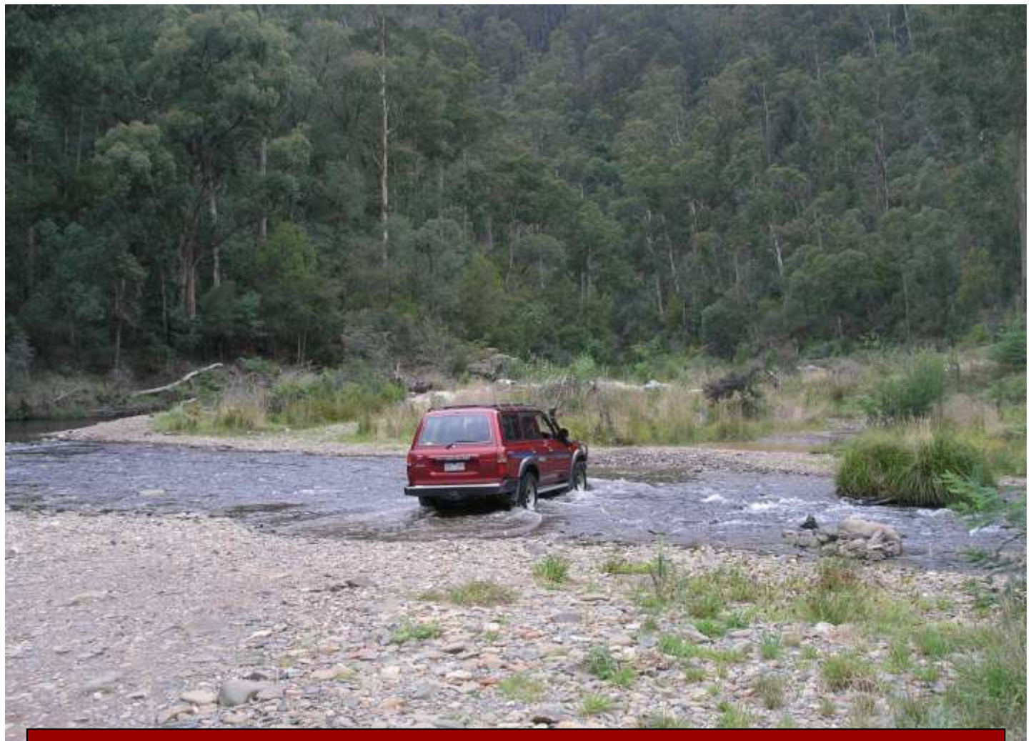
Water crossing during the Driver Training weekend 13 Jan 10