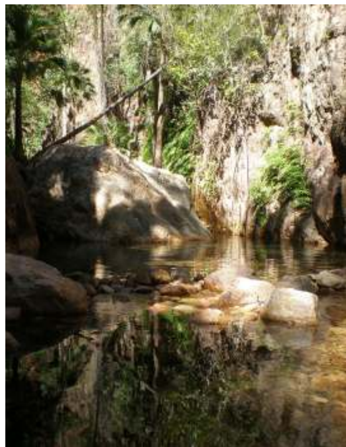
DAY 22 Time to explore ELQ. First stop Zebedee Springs where

the boys had a dip in the hot springs until the tour bus arrived! Off to ELQ Gorge where we walked and clambered over rocks and boulders and water to reach the stunning waterpool at the end. Welcome relief in 33 degree heat. Fortunately not crowded here and opportunity for swimming. Boys climbed over big boulders and further up the gorge to investigate, girls remained in calm waters. Paddled around here for about an hour and then scambled our way back to carpark. Returned to camp for late lunch and another restful afternoon. Ashley cooked roast lamb for all - yummo. Jan cooked Rosella crumble for dessert - more yummo. Rosella is a small bush with edible flowers that taste a little like rhubarb.