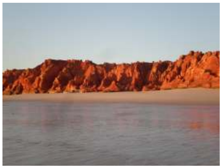
DAYS 40-41 Broome to Cape Leveque. Drove the 220kms north to

Cape Leveque on fairly ordinary sandy, corrugated road (what's new!) and into Kooljaman Resort. Let me tell you, the word "resort" is certainly used loosely in WA! Camping here was a bit iffy but the beaches more than made up for it. Of course there was the option of staying in bungalow style accommodation, but why would we when we have a 5-star trailer! Stunning coastlines here that show off WA's true colours - that fabulous Kimberley redat sunset (yes again - another great sunset) and the azure blue of the water. Probably sound like a broken record, but was truly stunning. Two beaches here - one east side/one west side - both of which were great.