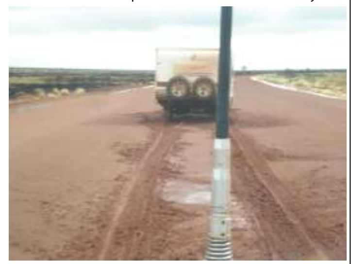
all our wet bedding. The sun goes down early - 4.30pm - and rises early - 6am - in WA, so it's early to bed and early to rise from this day forward.

We made a very early start, packing up a soaked trailer (not much fun) and on road by 7.30am. Now, after a 12 hour downpour (more than 20mms), the Tanami was wet, greasy, muddy - just the right condition for a rubbish day's driving... extremely taxing on both driver and passenger. ADM did sterling job to keep us out of trouble in a 4km stretch before Rabbit Flat (just one big slide almost into the gutter) while Derek was slip sliding his caravan along the middle of the road. Stopped at Rabbit Flat for fuel (Derek). Drove and drove till we reached the WA Border and decided to stop at around 4pm for another night bush camping at Sturt Creek, which turned out to be a perfect little oasis after a gruelling day. By this time, the weather had much improved and we were able to dry out