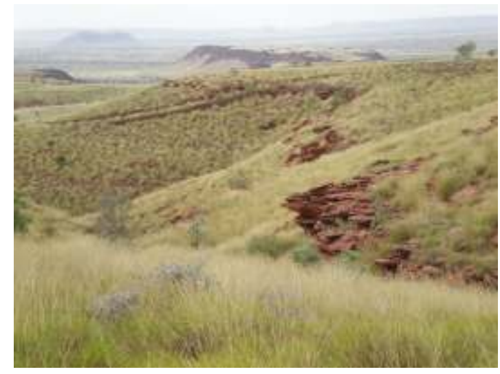
Day 46 Karijini to Millstream-Chichester NP for two nites. This NP is in the heart of the Pilbara and the change in the

landscape here is dramatic - the dark red soil covered by the green of the spinafex is a sight to behold. Actually looks as though the planting has been done by man - so evenly spaced are the clumps of spinafex - but all created by mother nature - amazing. Arrived late afternoon so not much happening first nite. Next day we drove the 80kms to Chichester (more fab scenery) where WE decided to do a small walk, 8kms! This hike was once the camel track used to transport wool through the Pilbara. Well, all good plans are meant to go awry... 2kms in LP was stung on the head by a bee!!! After much hysterical behaviour from LP and laughter by ADM (RAT!) he removed the sting and we continued along the track. This little adventure was obviously not meant to be for LP... next disaster, fall over in dry, rocky creek bed - this time not so amusing!!! Hurt left leg, not nice... not funny... but as we were almost half way through the walk we continued up hill and down dale til we reached the end. By then LP not feeling very happy, so ADM had to walk back to retrieve car from car park, drive back to collect me and then back to camp.