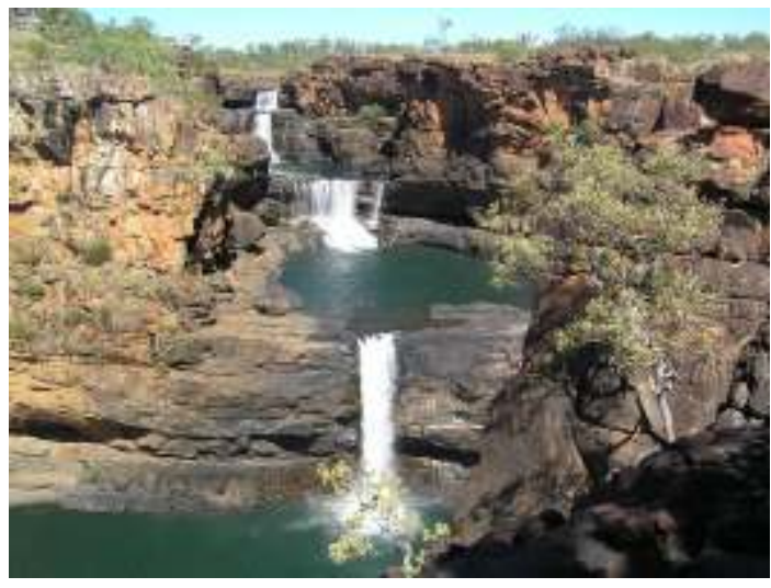
usual WA early end, we stopped for an o/nite stay at King Edward River - very nice spot speshly as free camping.

DAY 25 Destination Mitchell Falls... but as day was nearing its