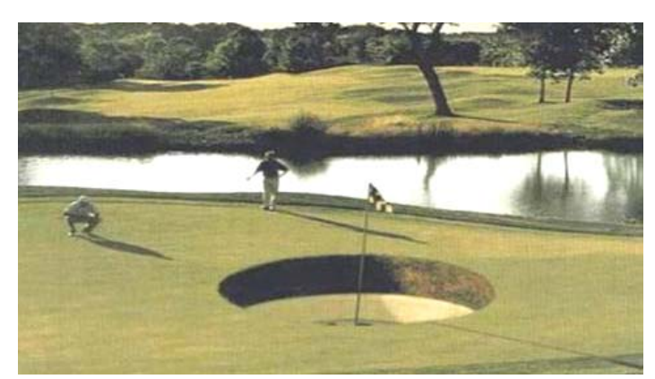
Golf for beginners...

To keep non members out of the group, your membership will need to be approved.