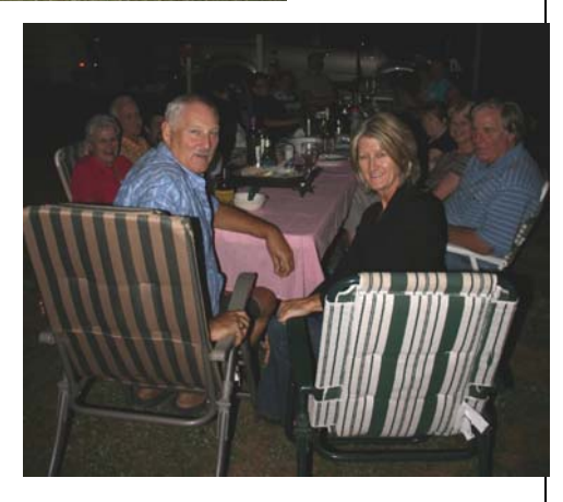
Smile for the birdie everyone...

exquisite and a credit to those who provided. The evening continued with many laughs and stories concerning flames and camping equipment. Not to mention a couple of glasses of wine, after all it was a wine trip.