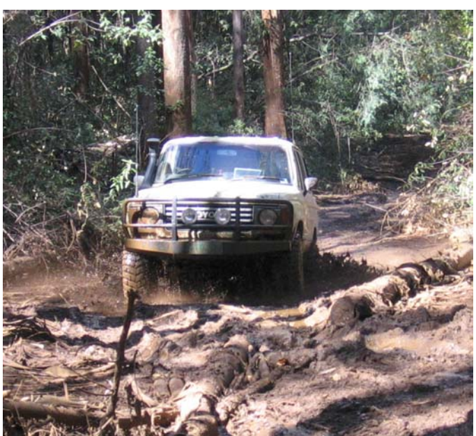
Tim traversing Woodmore Range Track

We were hoping to stop at Mt Murrindindi to have a bit of morning tea but that's no longer possible as the access track is now a huge quarry, so we carried on to Siberia Gap and stopped there for a break. From there we drove Black Range Road, the Devils Staircase (not entirely sure what was devilish about it) stopping every 50 yards or so to clear debris off the track, then on to Woodmore Range Track for more of the same.