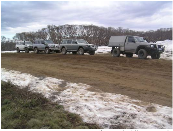
Line-up at Mt Skene summit

Our destination for the day was Mt Skene. We headed off around 8:30 am travelling up Jamieson-Licola Rd. We then turned onto Heyfield-Jamieson Rd and the ferocity of the recent bushfires was evident everywhere you looked. After about 1.5 hours of driving we arrived at Mt Skene which still had about 3-4 feet of snow covering the summit. We observed the remains of some igloos that had been built, admired the views across the Alpine region and took a few happy snaps.