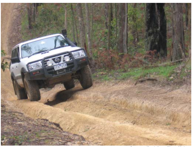
Gary climbing The Sisters

Now for the Three Sisters. I should have gone home at this point with the good name of Landcruisers still intact. Traveling the ridge line enjoying the views off to our left we reached a short steep drop to the gully floor with the choice of 4 tracks up the other side, and having watched Paul attempt the rather deep rutted one with a rock ledge thrown in just for fun it was decided we would take the right hand easy option.