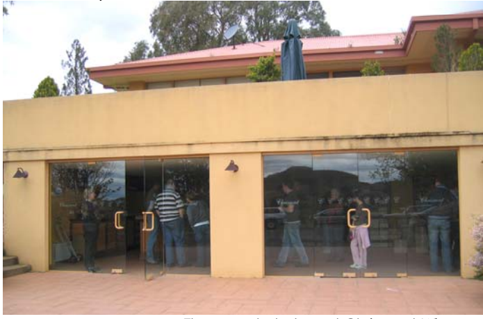
The gang holed up at Chrismont Winery

Next up was Chrismont, a particular favourite of ours and the darling of several of Melbourne's finest restaurants with its La Zona range. This was most people's first opportunity to try some new varieties of wine, including the Arneis, Sangiovese and the Marzemino Frizzante (that's fizzy red to the uninitiated).