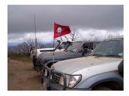
Then go to

http://autos.groups.yahoo.com/group/vfwdc