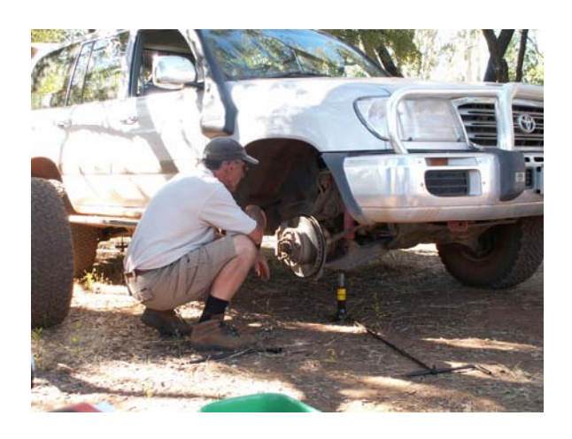
Have Faith will travel

For they bring an inner peace Which has no place with me For they may change my life To one of which I am afraid.