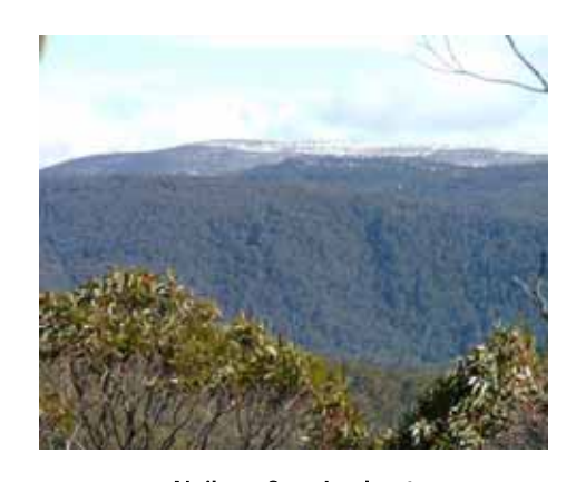
Neilson Crag Lookout

Back on our way and backtracked to Arbuckle junction around to our left and followed Moroko Road, and followed this to Doolans Plain track, there was nothing to much plain about this track, it was well covered with lots of trees, and made for some challenging driving at times and the trees that could not be traversed were swiftly removed with chain saws. At the end of the track we had lunch, and for the adventurous there was Neilson Crag lookout 800mt up the hill, there was a pretend path to walk up. The view was great!