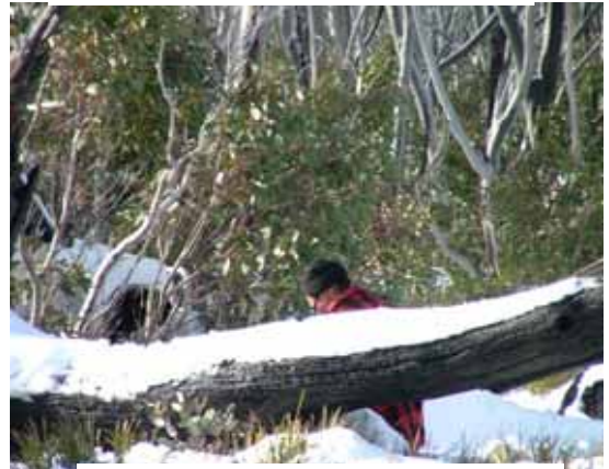
Carl hiding behind tree at Charlies Country