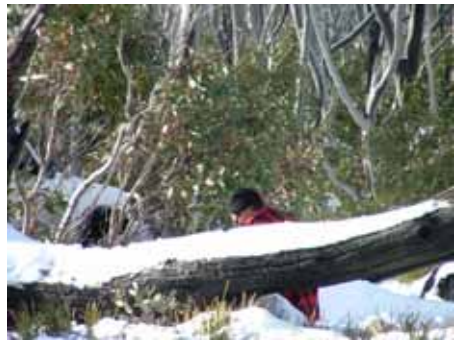
Carl hiding behind tree at Charlies Country

After lunch we backtracked towards B2 track, and after a couple of cars got stuck we got to practice some recovery skills, once free we arrived at an open area just above Charlies Country where some snow play continued, Carl took a real pounding from some snow balls.