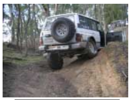
Marysville – June 2004 Toolangi – July 2004