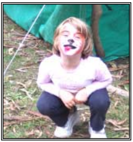
Elizabeth the Dog