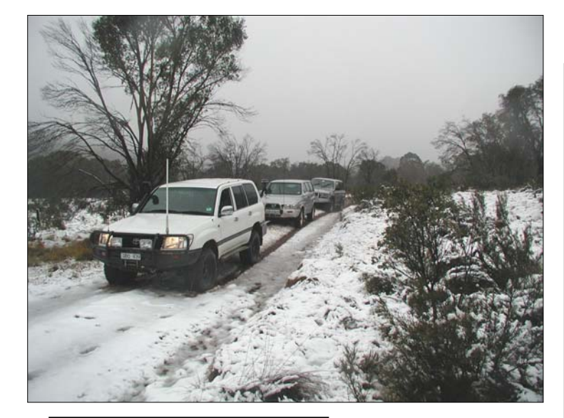
Licola - April 2004