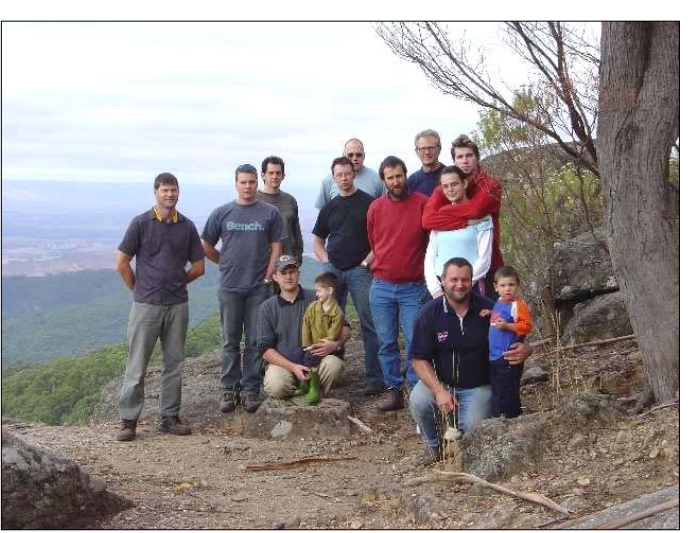
Warragul Rocks, Tallarook - April 2004