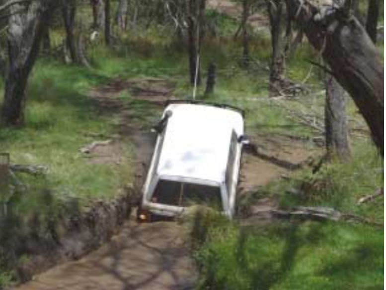
spot it was time to winch over the top. He then winched me over the top – and then it was Geoff's turn. Deep water and no snorkel (or funnel as some call it) is not a good mix.

Some days are just better than others! [pic avb] It was Craig's turn next. Having reached the same