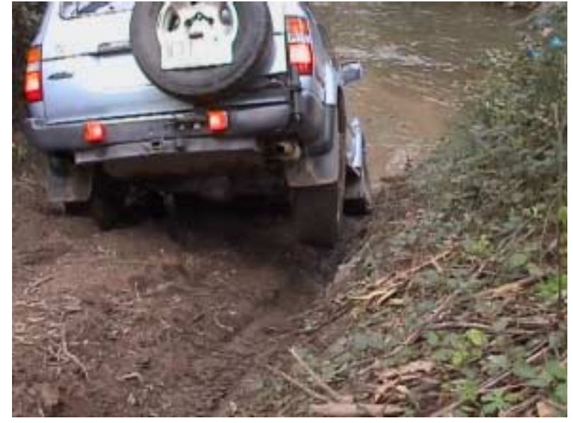
Murray tiptoes into the river.