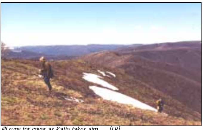
Jill runs for cover as Katie takes aim... [LP]

With the sun having a clear path, the 'young' revellers didn't seem to feel the cold of the snowballs hitting their tee shirts.