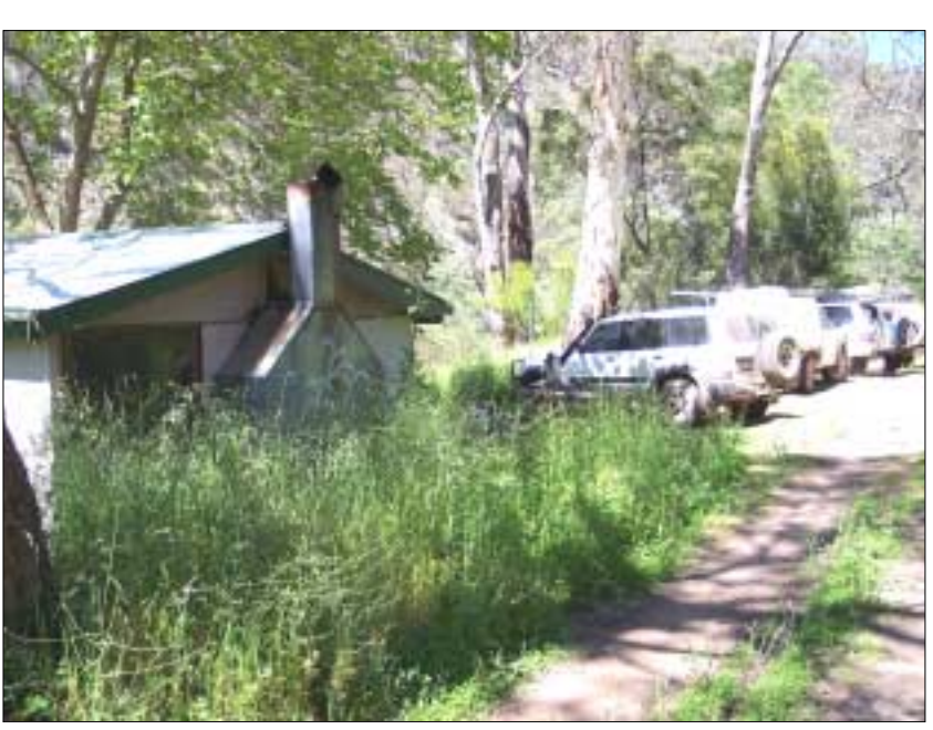
An overgrown Collins Hut [JP]