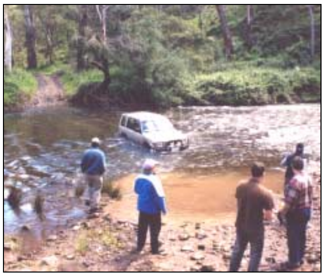
Every picture tells a story... [John Partridge]

Around the next bend we found the second river crossing with a rather large obstacle - a drowned Jackeroo.